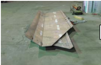
AR400 forming -17' x .500"

Some of our other capabilities available: