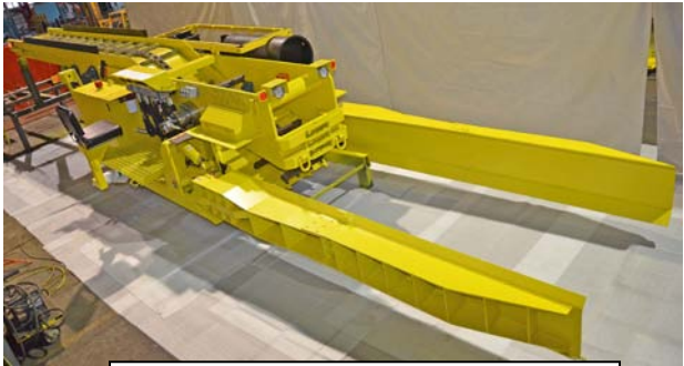
Equipment design, fabrication and assembly services.

Equipment Forming up to 20' x 1000 Tons Burning up to 96" x 240" Shearing up to 12' x 1/4" Rolling up to 6' x 1/4" Saw cutting up to 30" x 25" GMAW, FCAW, SMAW,GTAW,SAW Machine shop Wet painting Design/Engineering Electrical controls/PLC